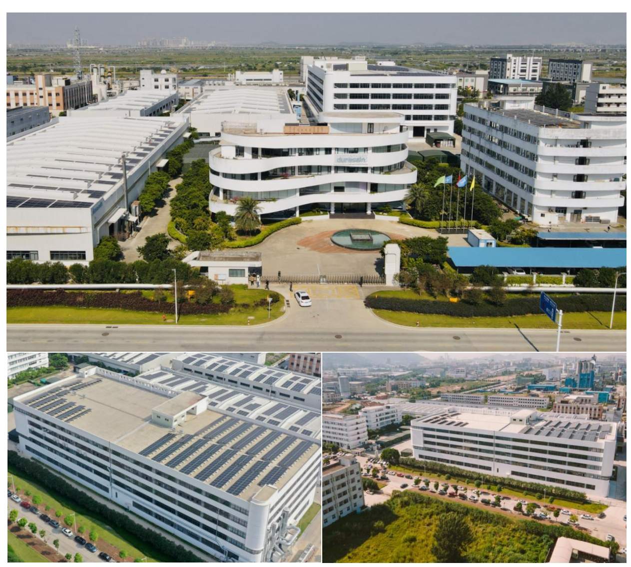
Pictures: factory building of Guangdong RELANG New Material Technology Co., Ltd.

Guangdong RELANG New Material Technology Co., Ltd. was established in 1999. At Guangdong RELANG New Material Technology Co., Ltd. we make industry leading Durasein® solid surface for people with big, bendy, twisty ideas. But we are really in the business of making the wildest creative dreams of designers come true. At Guangdong RELANG New Material Technology Co., Ltd., we know our material inside and out, providing exceptional support from R&D through production and installation- we help push and set the standard for Solid Surface. Our sheets and shapes have inspired some of the most prominent creative firms in the industry and have been fashioned by topnotch fabricators in more than 55 countries on 6 continents. We are here to help our customers achieve anything they can imagine. So go ahead and dream, and see what we can do for you.